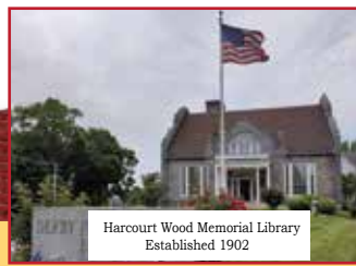
Harcourt Wood Memorial Library Established 1902