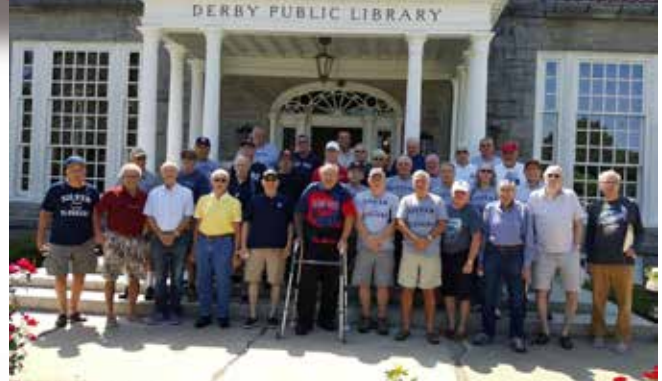
Shown here is the group picture taken of the 400th meeting of the Silver Sluggers in August, 2018.

Join the Silver Sluggers on June 6th (499th meeting) at 10:00 am tfor more baseball updates. The June 20th meeting of the Silver Sluggers will mark their 500th meeting! DPL will honor that milestone with fun baseball trivia, a group picture in front of the 1902 Derby Public Library Building and of course, "peanuts and Cracker Jack!"