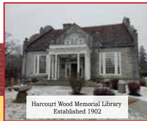
Harcourt Wood Memorial Library Established 1902

Masks are preferred for all indoor events