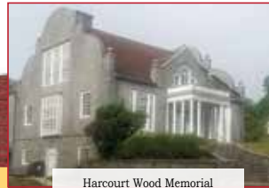
Harcourt Wood Memorial Established 1902

Follow us on Twitter & Facebook & our YouTube channel! Twitter @DerbyPublicLib Facebook @DerbyPublicLibrary YouTube: https://bit.ly/2P0f1p0