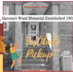
Harcourt Wood Memorial Established 1902

Follow us on Twitter & Facebook! Twitter @DerbyPublicLib Facebook @DerbyPublicLibrary