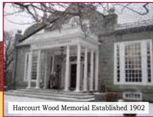
Harcourt Wood Memorial Established 1902

Follow us on Twitter & Facebook! Twitter @DerbyPublicLib Facebook @DerbyPublicLibrary